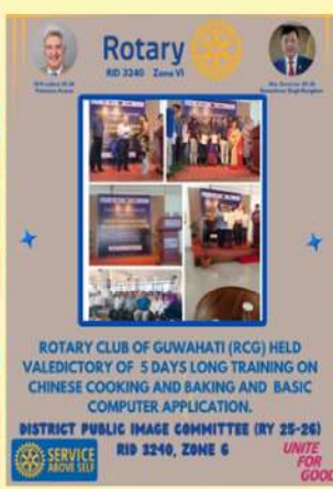
On 17-10-25 -Valedictory and certificate distribution of Skill Development Program to the participants.