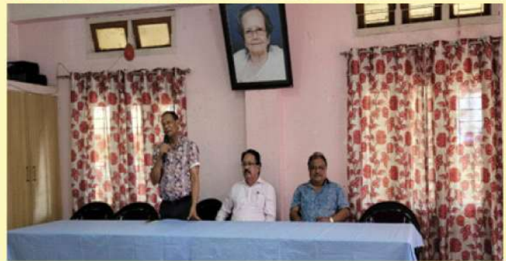
Inauguration of 5 Days 13-10-25 Days Skill Development Program on “Chinese Cooking and Baking and Basic Computer Application”